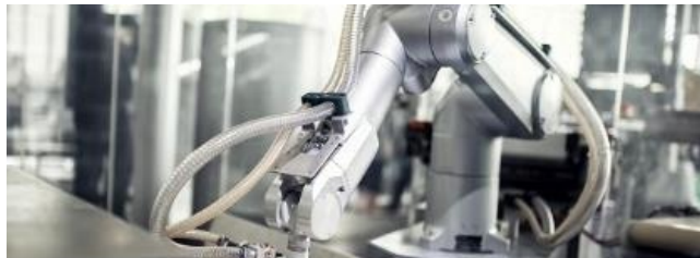
MACHINERY & EQUIPMENT