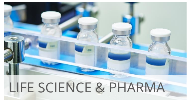
LIFE SCIENCE & PHARMA