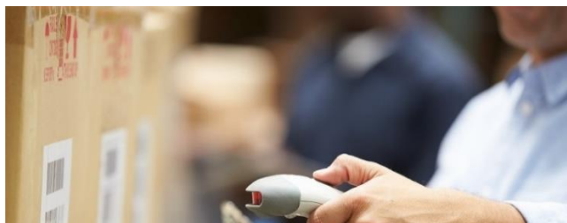
LOGISTICS SERVICE PROVIDER